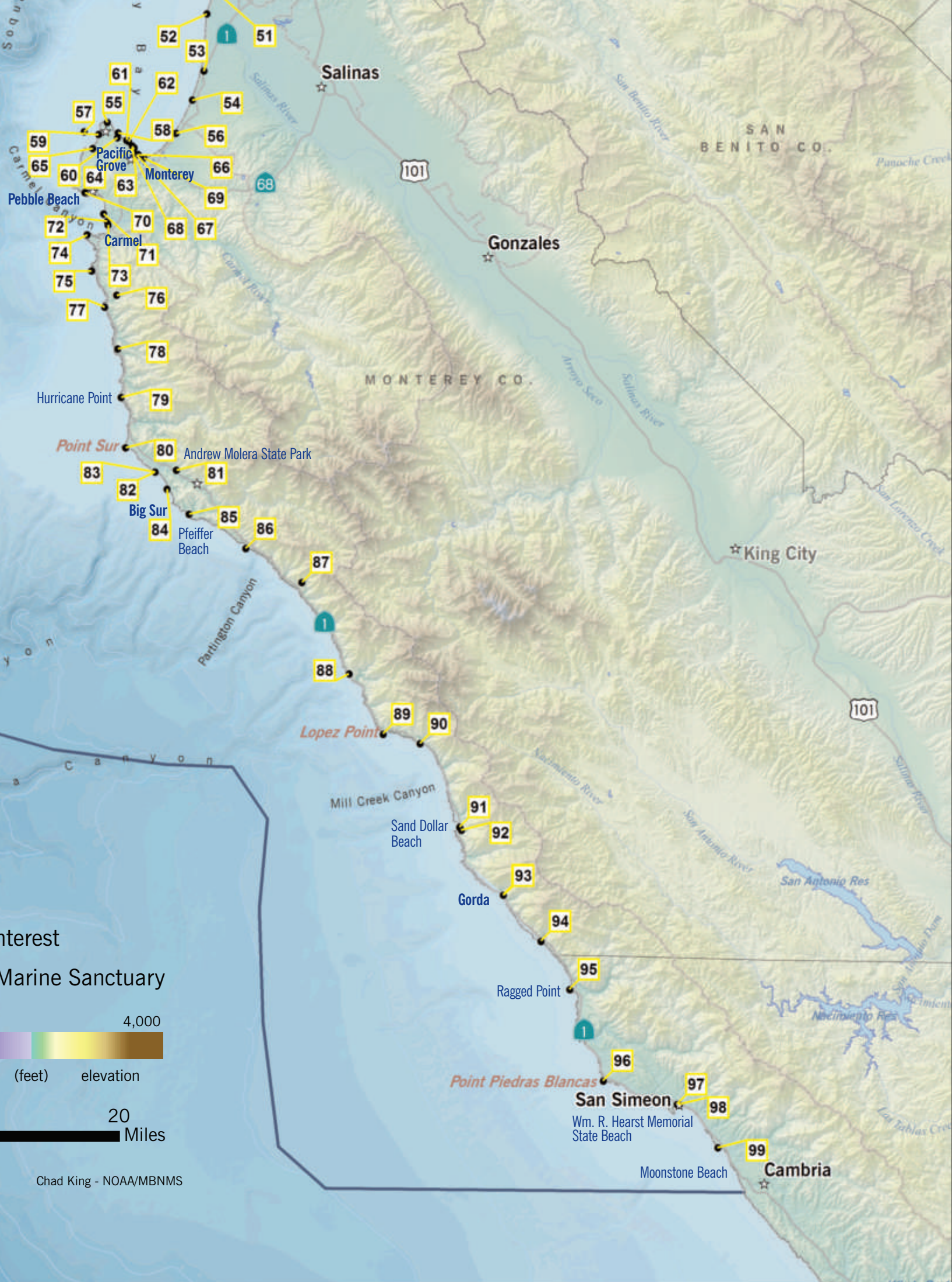
Chad King - NOAA/MBNMS