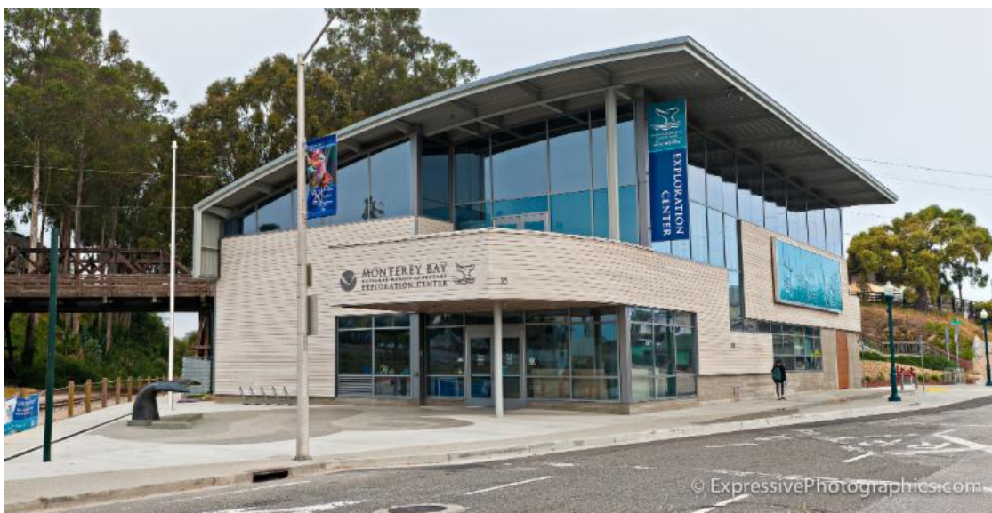
Sanctuary Exploration Center

Hours: Open Wednesday through Sunday, 10am - 5pm (Closed Monday and Tuesday)