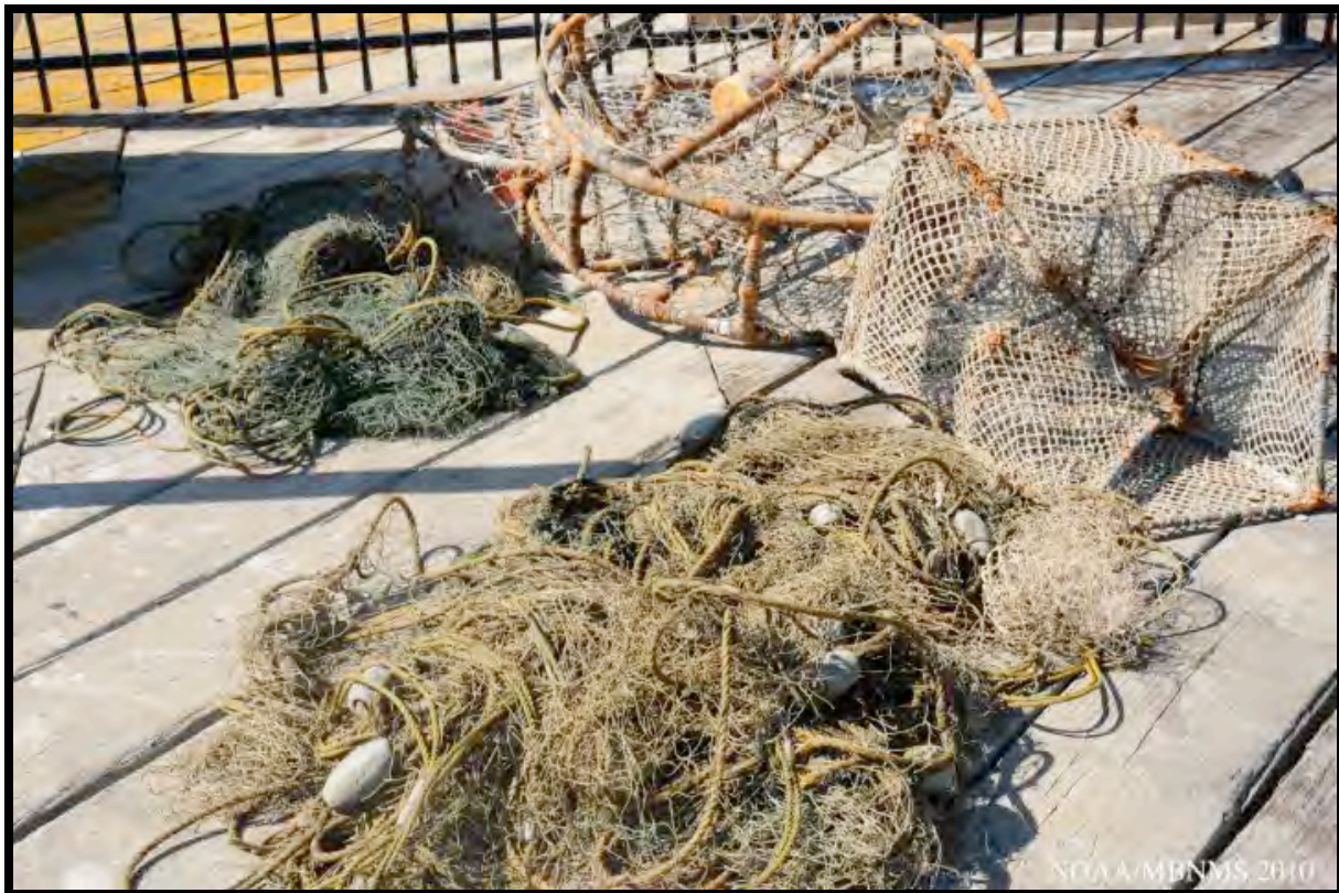
Two rockfish gill nets, two crab traps and a spot prawn trap laid out to dry on a dock.

The sanctuary funds this collaborative project through a federal settlement that focuses on mitigating impacts to benthic habitats, and a marine debris grant awarded to the UC Davis SeaDoc Society. Cordell Bank National Marine Sanctuary (CBNMS) provided the Phantom HD2 ROV and staff planning and mobilizing support. California Department of Fish and Game (CDFG) provided inkind, equipment support and deck support. California State University Monterey Bay (CSUMB) provided deck support and data analyses. Marine Advanced Technology Education (MATE) Center provided a volunteer intern for deck support. San Francisco State University, Romberg Tiburon Center provided a graduate student for specimen collection and study. Other key contributors included the F/V Donna Kathleen , Marine Applied Research and Exploration (MARE) and NMFS. A web page containing photos and a description of the project can be found at http://montereybay.noaa.gov/resourcepro/resmanissues/lostgear.html