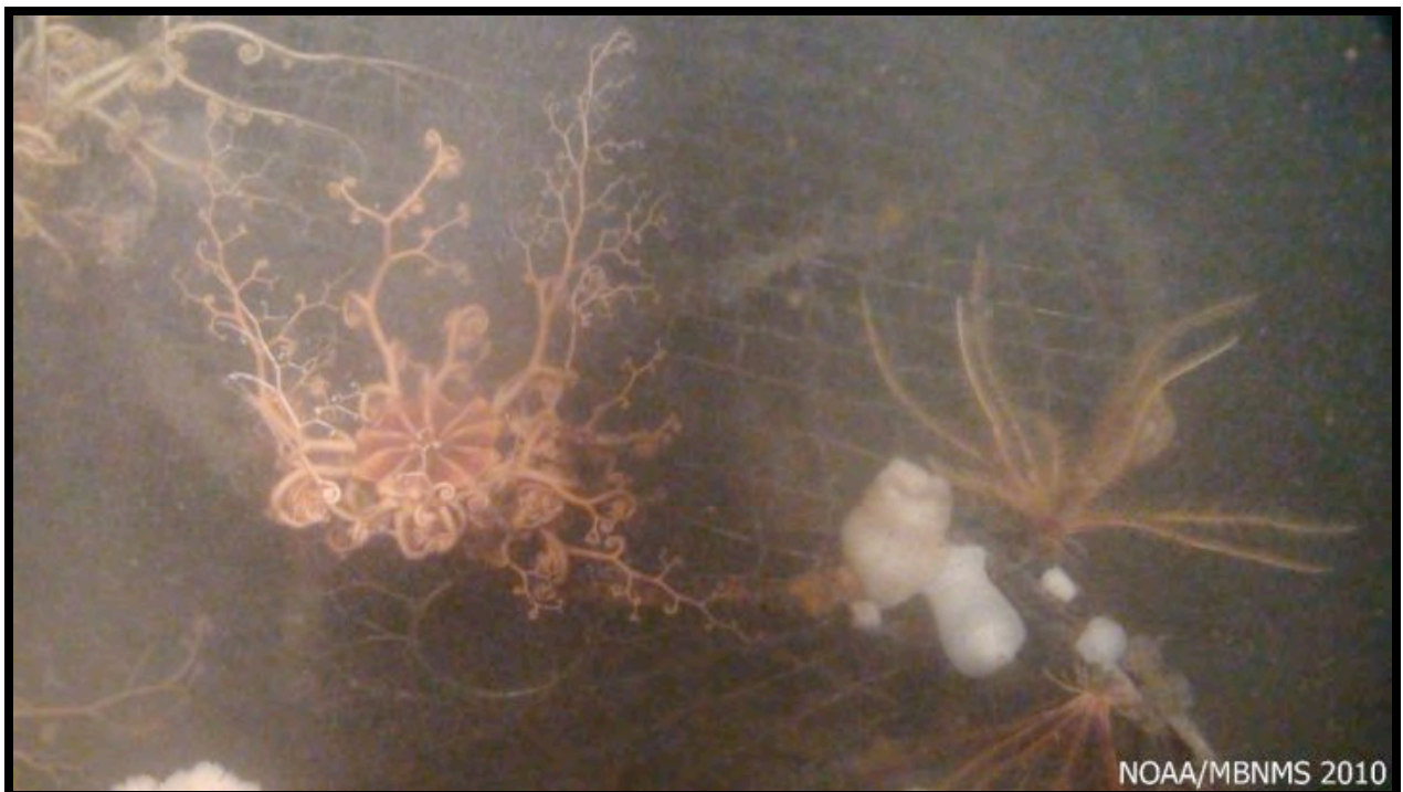
This crab pot was found and retrieved at So Monterey Canyon. The animals were photographed and cataloged and then released back to the water.