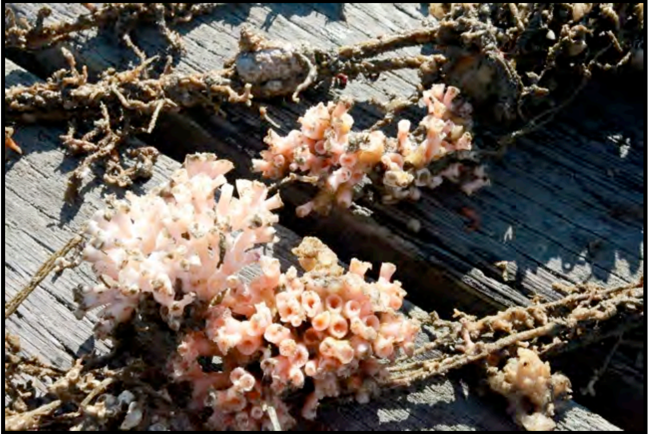
Lophelia Pertusa , a species of deepwater coral found encrusting a net in Monterey Bay; it is rarely seen in the Pacific Ocean.