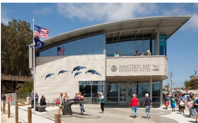
Sanctuary Exploration Center in Santa Cruz.

Often called "An Oasis in the Deep," Davidson Seamount is abundant with a diversity of deep sea organisms, including sponges, crinoids, crabs, octopus, fishes, and large numbers of rare and unidentified benthic species. It's home to more than 25 species of deep sea corals, including bamboo corals over 200 years old! Although relatively unexplored, Davidson Seamount has special national significance to ocean conservation with ecological, scientific, educational, and historical importance.