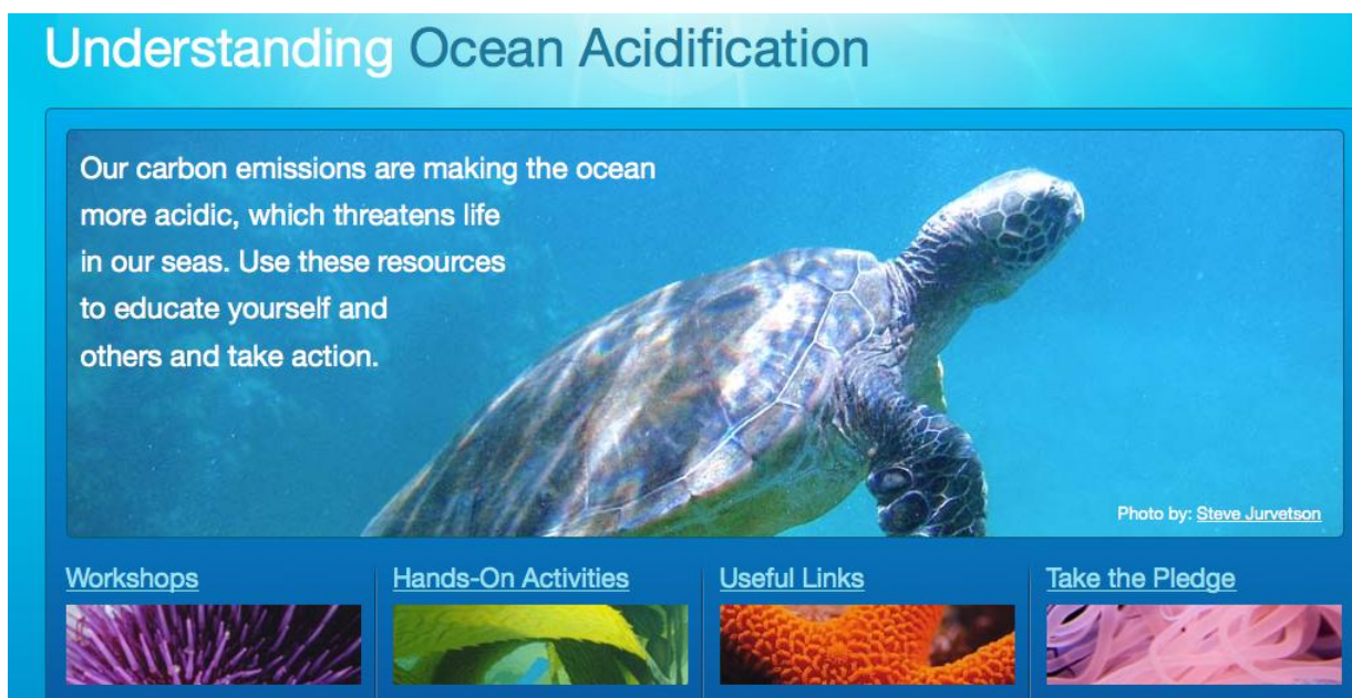
Figure 2. Screen Shot of Understanding Ocean Acidification Web Site, http://cisanctuary/acidocean

Year 5: $125K including $70K for 2/3 time FTE to implement OA Education, $15K evaluation, $40K determine based on evaluation, what activities programs and work best and implement, analyze data, produce evaluation report. Limited progress can be made with existing staff resources. Some sub-activities are ideal for grant funding