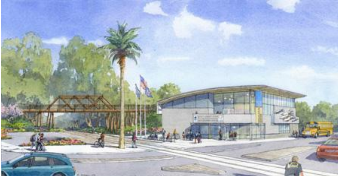
Figure 3. Depiction of the MBNMS Santa Cruz Exploration Center currently under construction using LEED® building standards.