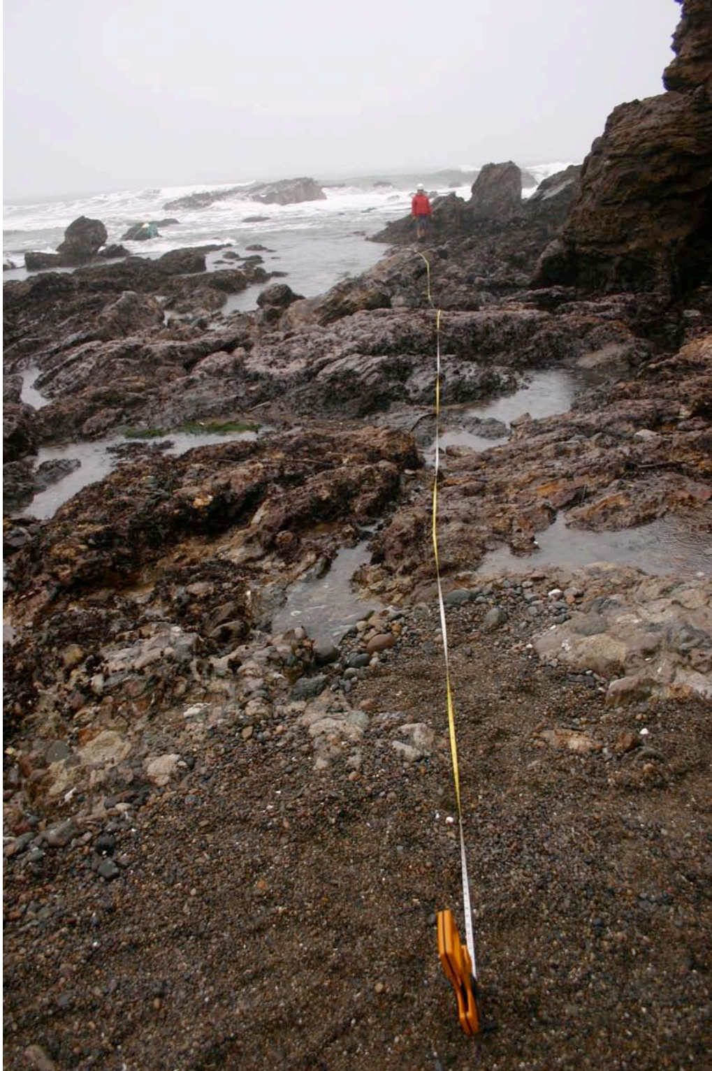
Figure 9. Transect #2 on northern side of channel, at edge of impact site, in an area that appeared to have the greatest amount of freshly broken rock (12/06/07).