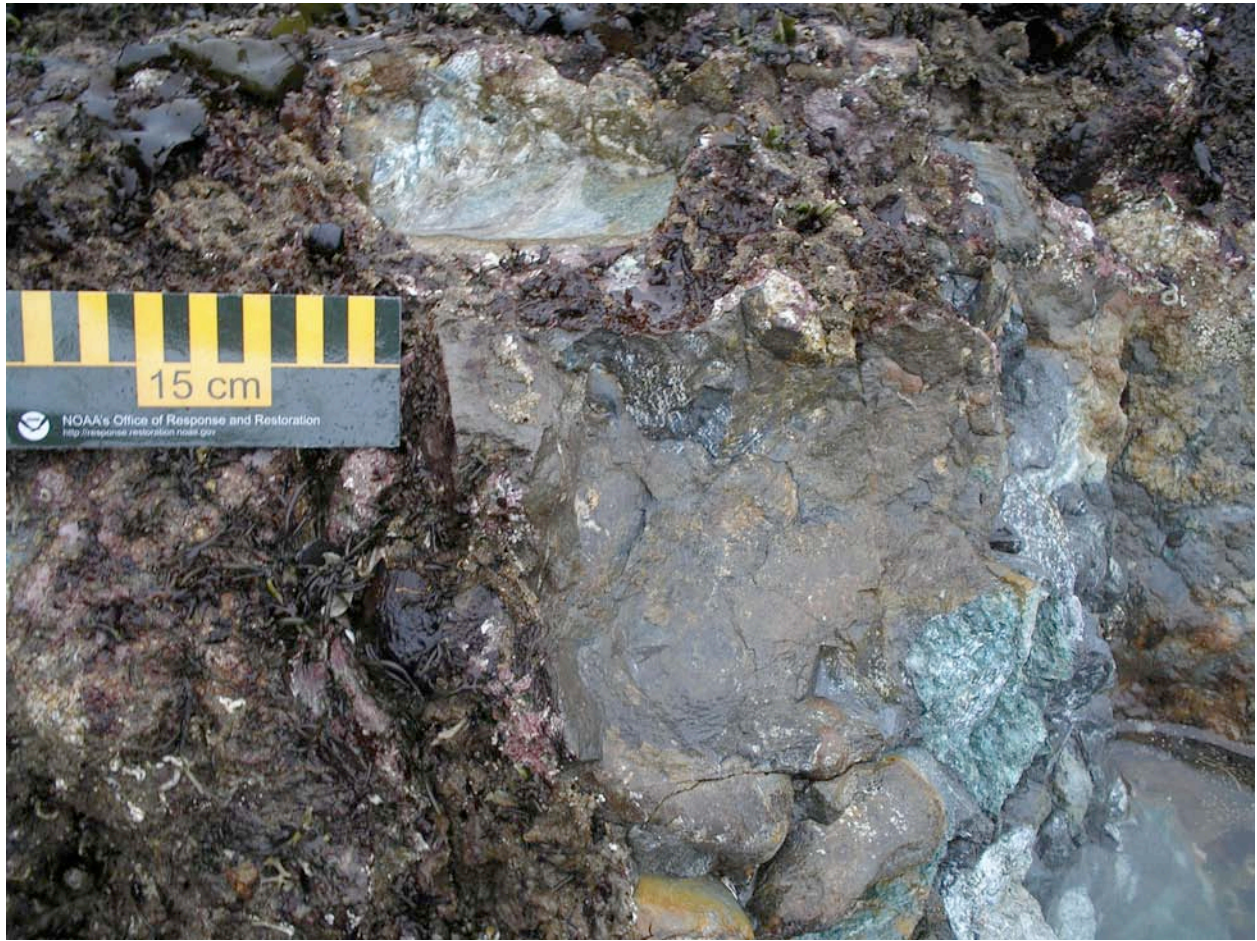
Figure. 7. Broken sedimentary rock at F/V Lou Denny Wayne grounding site (12/06/07).