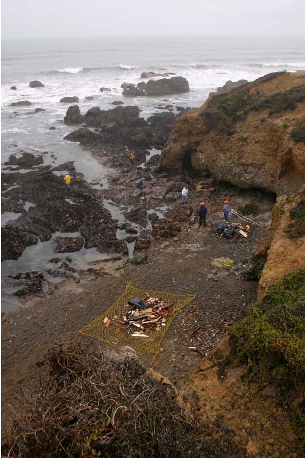
Figure 5. Removal of trash from F/V Lou Denny Wayne grounding site (12/06/07).