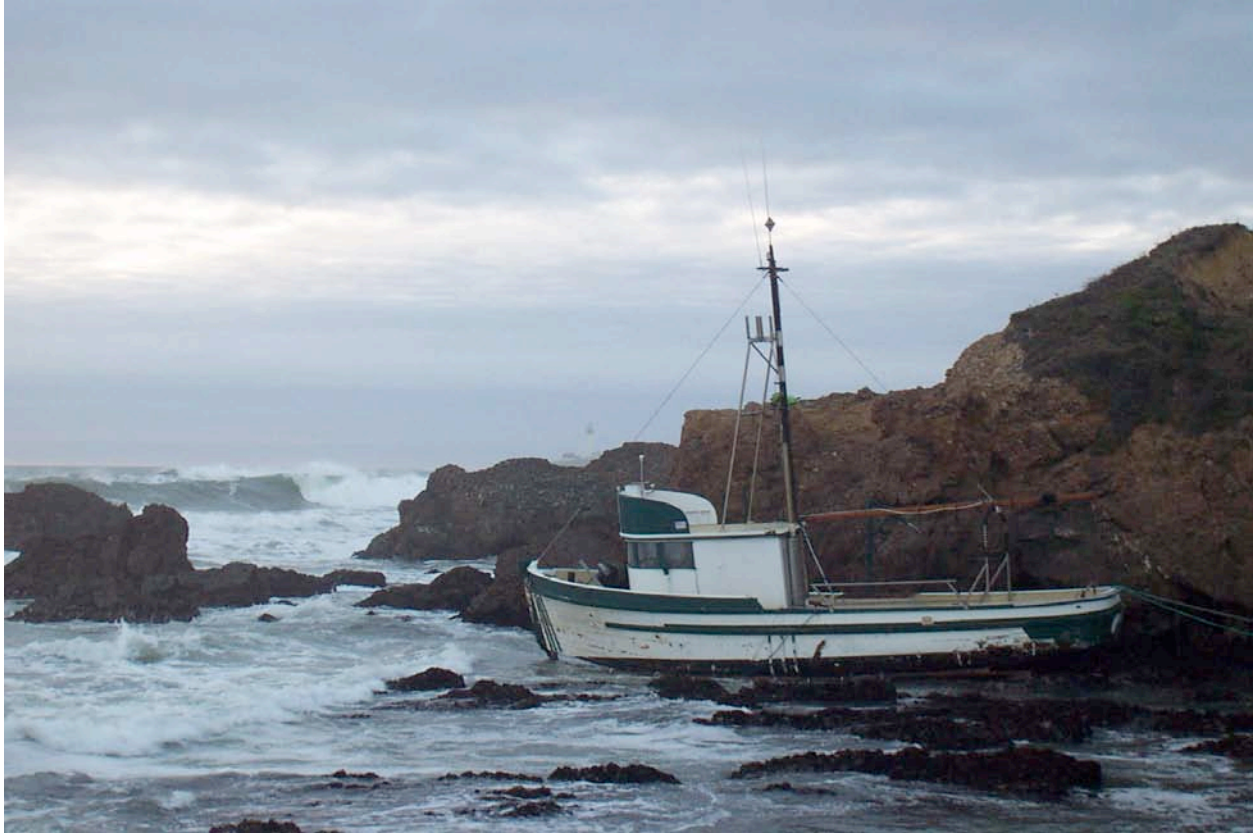
Figure 1. F/V Lou Denny Wayne grounding, approximately 1.4 miles SE of Pigeon Point, California (12/03/07).