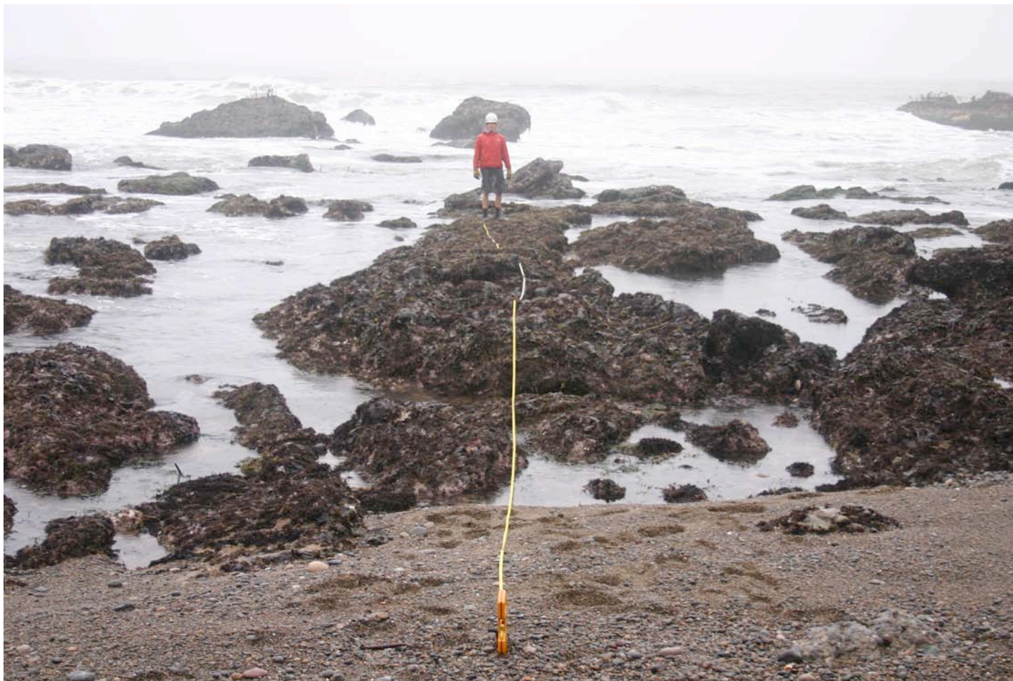
Figure 10. Transect #3 on southern side of main cove served as undisturbed reference site (12/06/07).