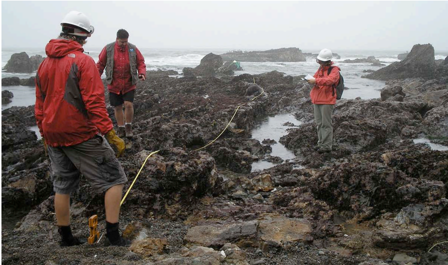
Figure 8. Transect #1 on southern side of channel. An area that appeared to be less impacted than the northern side of channel (12/06/07).