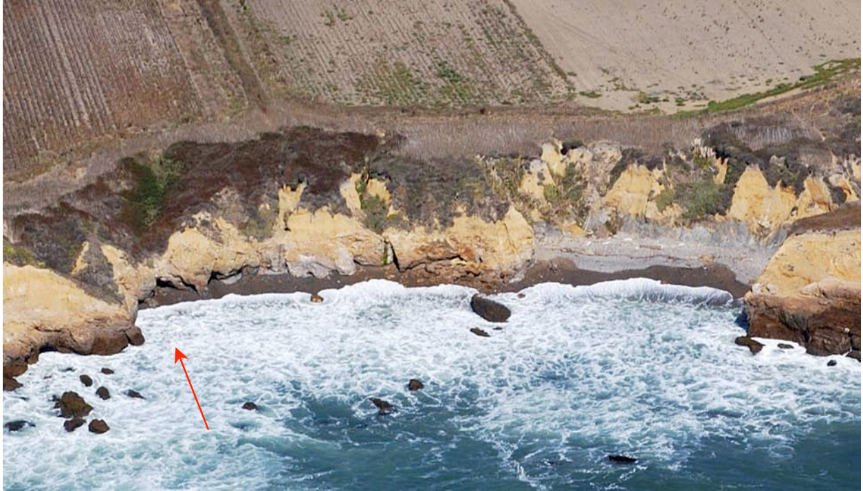
Figure 2b. Grounding site of F/V Lou Denny Wayne (red arrow), approximately 1.4 miles SE of Pigeon Point, California.