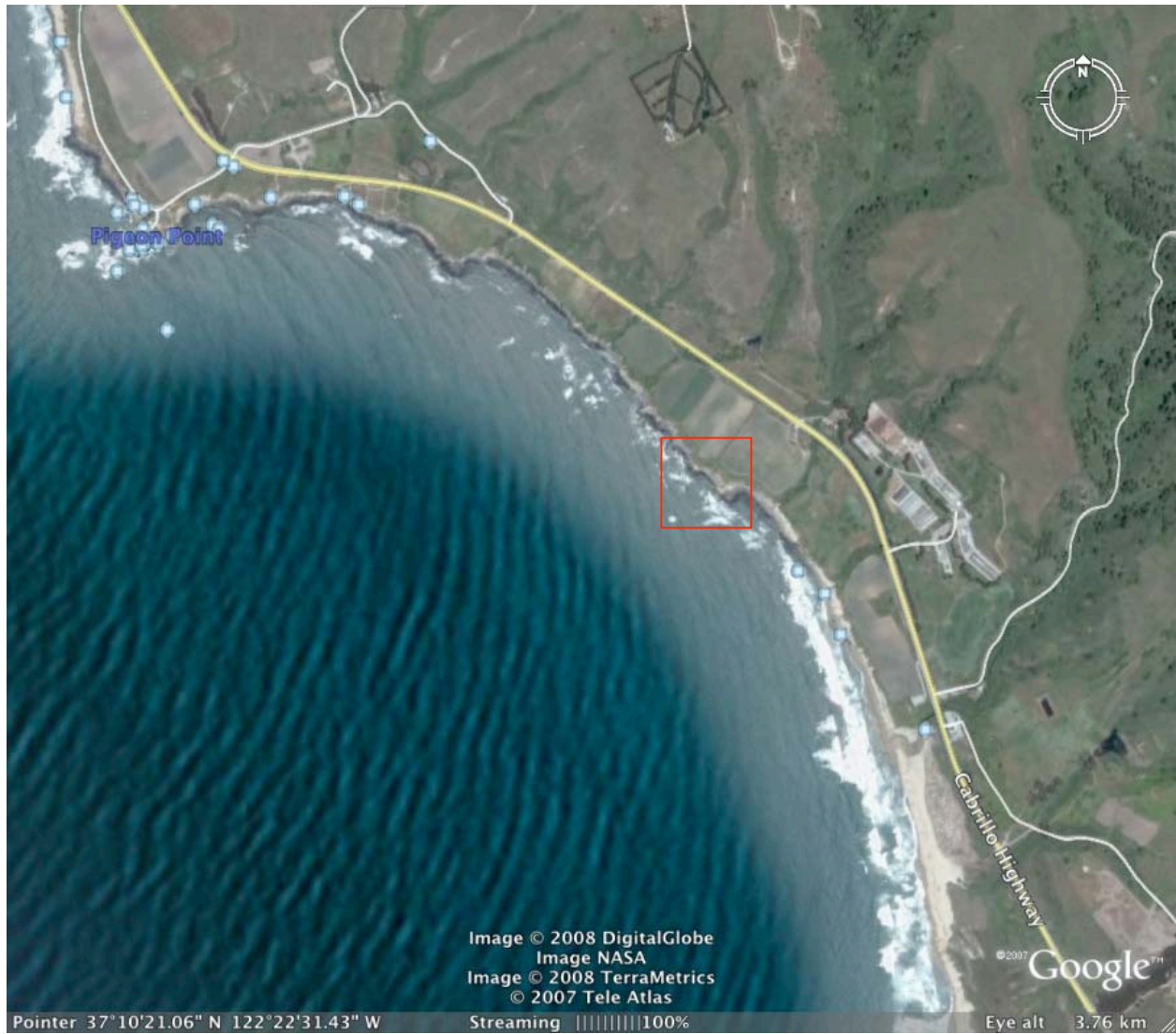
Figure 2a. Grounding site of F/V Lou Denny Wayne (red box), approximately 1.4 miles SE of Pigeon Point, California.