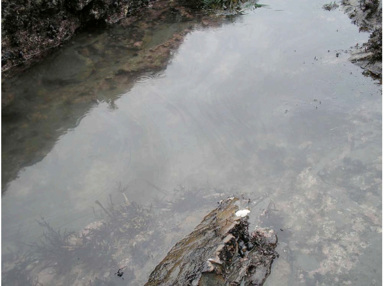
Figure 6. Oil sheen at F/V Lou Denny Wayne grounding site (12/06/07).